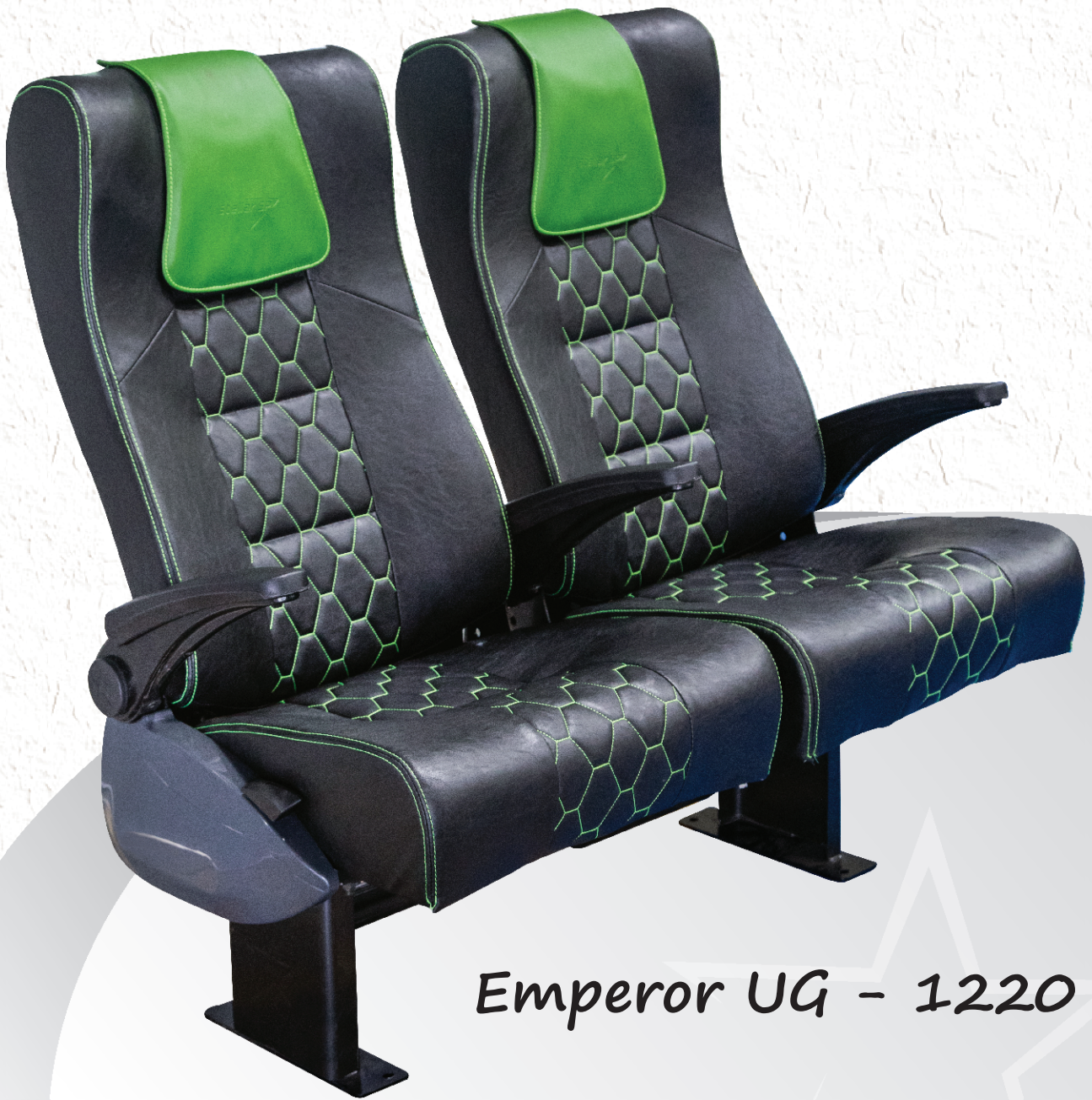
Emperor UG - 1220