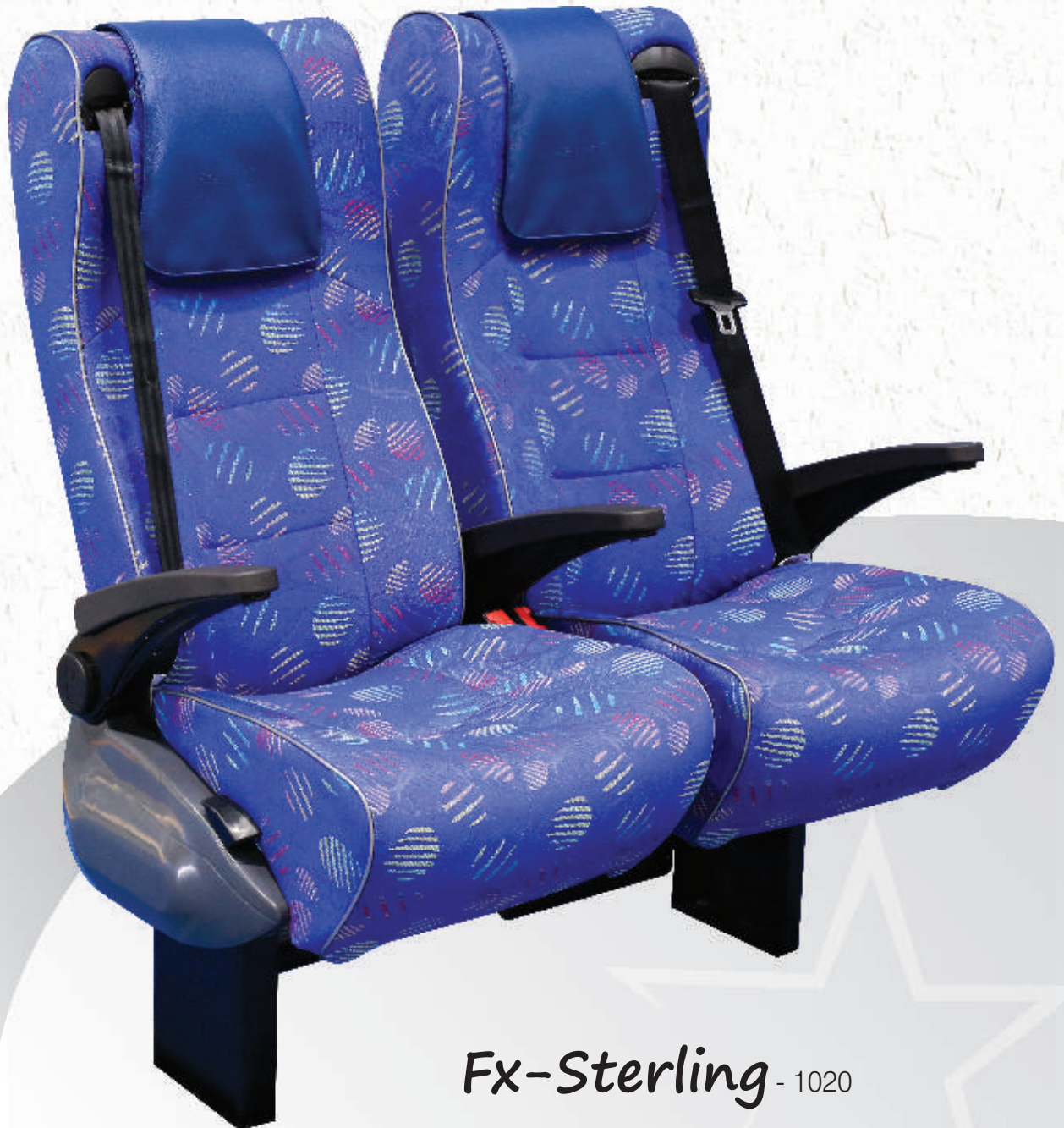
Fx-Sterling - 1020