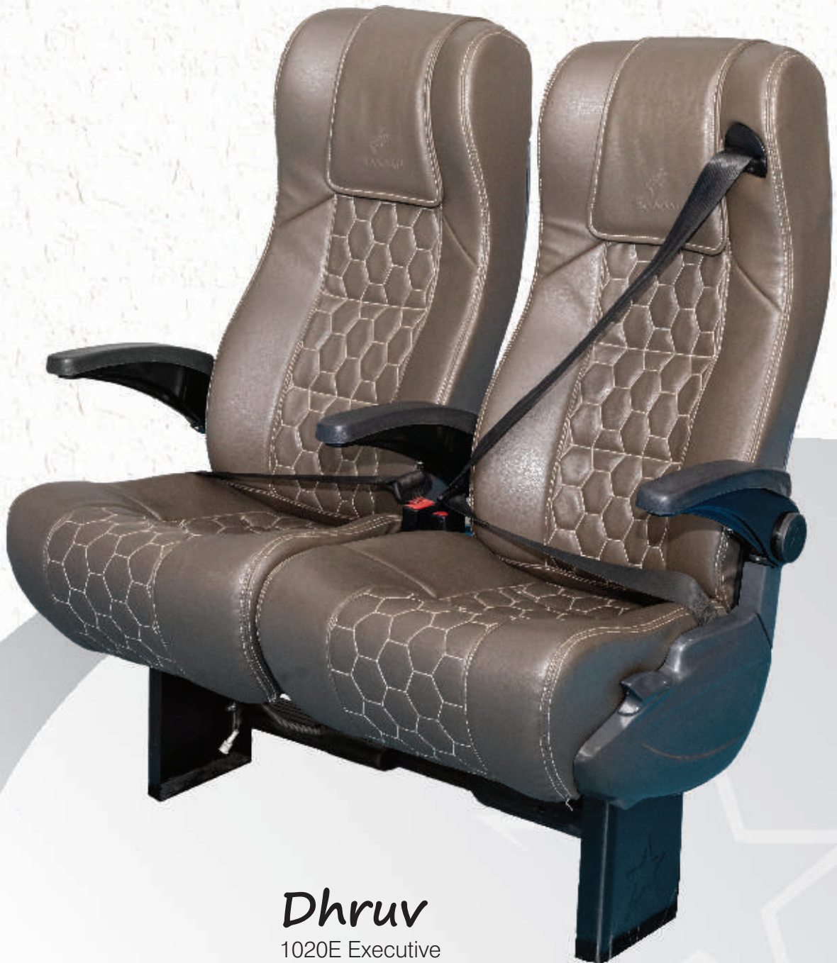
Dhruv 1020E Executive